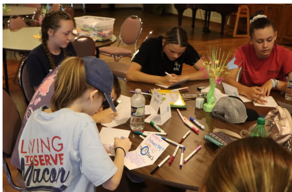
Middle School Students on Mission June 14-17

Middle School students served with City of Hope organizing their warehouse and distributing meals to families in need. They also worked with Chosen for Life Ministries creating 60 gift bags for Athens Department of Family & Children's Services. Each student wrote letters of encouragement including scripture with the notes. High School students served as leaders in Vacation Bible School.